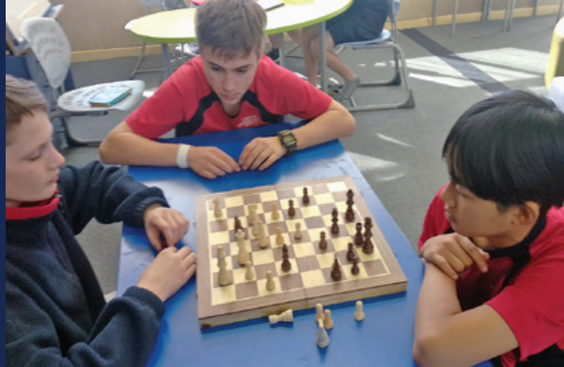
Chess, Year 7 and 8 South Island Champions