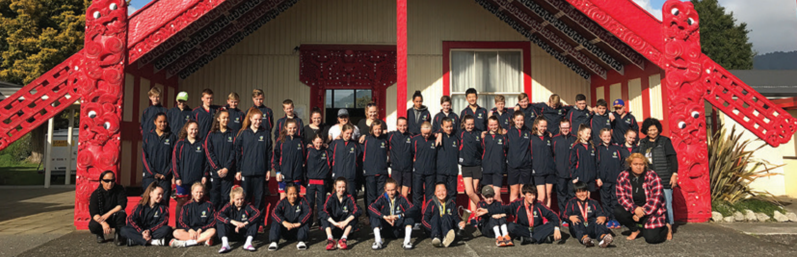
AIMS Games Athletes