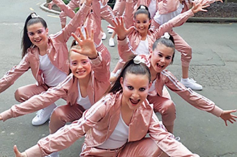
Jump Jam, 2nd at South Island Regional Competition